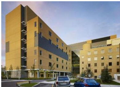
The Robbins Pavilion